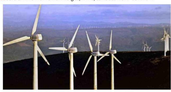
arded for 4.12 lakh tonnes of

pared with 2.8 GW added in the same period last year. Five States — Karnataka, Maha-rashtra, Rajasthan, Tamil Nadu and Gujarat (in this order) — accounted for 74 per cent of open access installations. This trend is notable because open access sales fetch better price for developers and lowers the cost of power for consumers. In 2021-22, open access con-