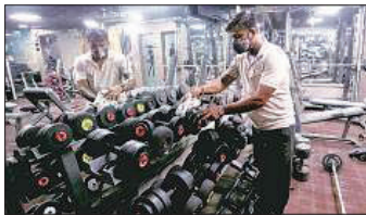
The order to open gyms comes as a relief to 5,500 gym owners and a workforce of 1 lakh people.

As per the directives, the DDMA and other departments/authorities concerned shall be responsible for strict compliance of the SOPs laid down by the government. If violated, the owner and manager of the premises will be held liable for prosecution under DDMA Act 2005, besides sealing of such premises.