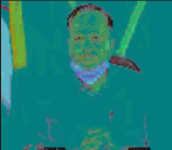
Health Minister Satyendra Jain at a press conference on Sunday.

hospital admissions. While home isolation cases have gone up by almost 45% in a week, the number of admissions in the Covid-19 hospitals has increased by 27%.