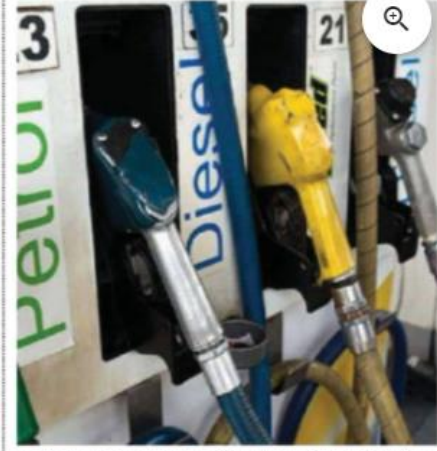
Petrol prices have surged past ₹100 a litre mark in all major cities

The Clufter increase in rates overlight is the highest ever any equivalent period in two decades, according to price information available from state-owned fuel retailers.