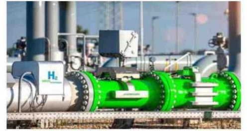
NEED OF THE HOUR. The development assumes significance as this will help India, the world's third largest energy consumer, save on fossil fuel imports istoce

by-product. However, using hydrogen has its own disadvantages.