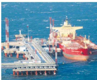
Global benchmark Brent edged higher toward $75/ barrel after slumping by 11% in the longest losing run since Feb.