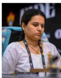
Humpy.

"I will be taking part in the World Rapid and Blitz team championship in Kazakhstan from July 31 in which players from different countries will be in each team and also then in the Grand Prix Series in