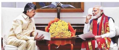
Andhra CM N Chandrababu Naidu had visited New Delhi on July 4 when he met PM Narendra Modi

While the previous visit of Naidu was Budget-focused, the current one will have him discuss Andhra's medium-term financial and infrastructure needs, sources said. Unlike the previous visit, where his party MPs had accompanied him to the meetings, sources termed the current visit as "low profile", with one-on-one meet-