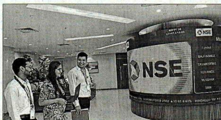
The Nifty has risen 6.56% in December, and is on course for its best month since July 2022.

Oil & Natural Gas Corporation, Oil India, Mangalore Refinery and Petrochemicals and Chennai Petroleum Corporation