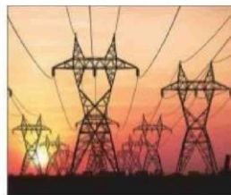
State-owned Power Grid owns and operates the bulk of inter-state and inter-regional transmission projects in the country

India has achieved only 61.5% of its target on expanding power transmission lines in the first half of the fiscal, data from the Central Electricity Authority (CEA) showed.