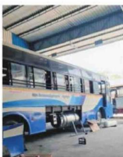
An LNG-fueled bus can approximately cover 850-900km on a 180-kg cryogenic tank filled to full capacity | EXPRESS

Official sources told TNIE the conversion of buses to LNG is currently underway in Villupuram and Chennai. "Our current target for diesel mileage is