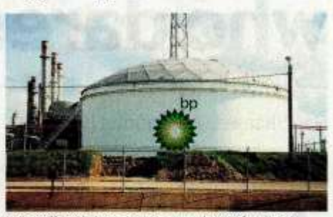
BP has offered help to raise the output by 44% for oil and 89% for gas.

'The TSP will review the field performance and identify improvements in reservoir, facilities and wells to enhance the production from Mumbai High field. The TSP has indicated a substantial increase in oil plus oil equivalent gas pro-