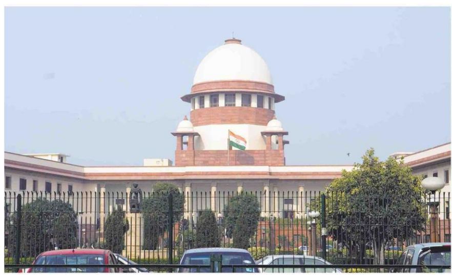
The court noted that when one party has the sole authority to appoint an arbitrator, it creates a power imbalance

The initially proposed draft amendment to the Arbitration and Conciliation