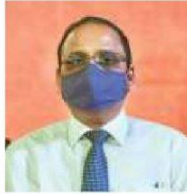
Manoj Jain, GAIL (India) CMD

in increase in the profit as compared to Q1 FY21. The physical performance improved by 18 per cent in natural gas transmission, 9 per cent in gas marketing, 10 per cent in LPG transmission, 22 per cent in petrochemical sales and 12 per cent in liquid hydrocarbon sales.