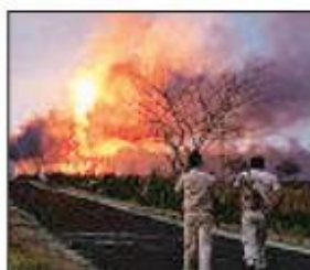
The Baghjan fire. File

Baghjan in Tinsuika district was precipitated by the blowout at well number 5, reported on May 27. On June 9, the well—located close to the Dibru-Saikhowa national park—caught fire, leading to the deaths of two OIL firefighters.