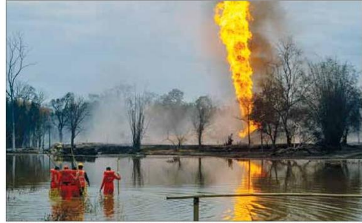
NDRF personnel search for the missing fire-fighters at a pond near an oil well as Baghjan oil field continues to burn, in Tinsukia district of Assam

The state-owned OIL has given financial aid of Rs 30,000