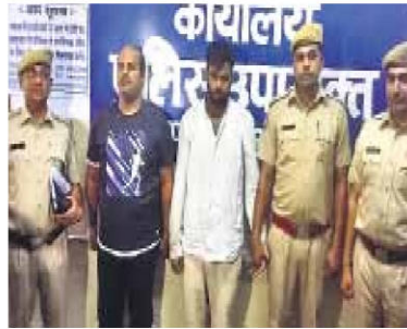
राजावास। हिंदुस्तान पेट्रोलियम पाइप लाइन में तेल चोरी मामले के मुख्य सरगना पुलिस गिरफ्तार में।