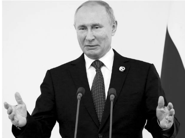
Russian President Vladimir Putin

The announcement marks the first time a senior leader from the group has indicated the curbs could be needed into 2020. That reflects a somber