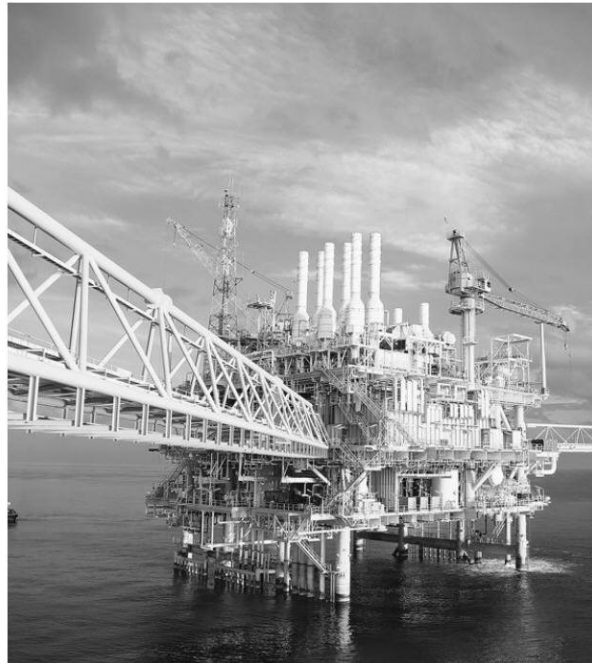
The Tapti fields went into a phase of decline after 2008 and cessation of production was finally declared in March 2016

The Tapti fields went into a phase of decline after 2008 and cessation of production