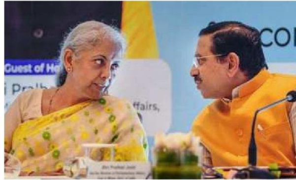
BIG STEP FORWARD. Finance Minister Nirmala Sitharaman with Coal Minister Pralhad Joshi at the launch of sixth tranche of auction for commercial coal mining, in New Delhi on Thursday

“Eleven States can directly benefit from today’s (Thursday) auction. This will open up their capacities. The sixth tranche takes a very big step forward in releasing greater resources,” she added.