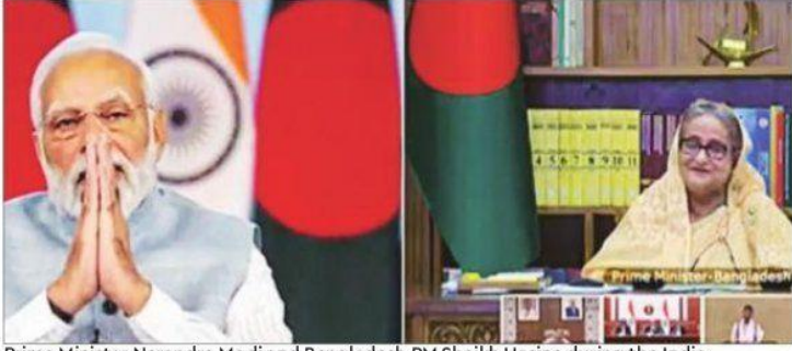
Prime Minister Narendra Modi and Bangladesh PM Sheikh Hasina during the India Bangladesh Friendship Pipeline inauguration via video conferencing on Saturday

The construction of the pipeline project started in 2018. It is the first cross-border energy pipeline between the two neighbours. Of the total cost of ₹377 crore of the project, ₹285 crore of the Bangladesh section of the pipeline has been borne by the