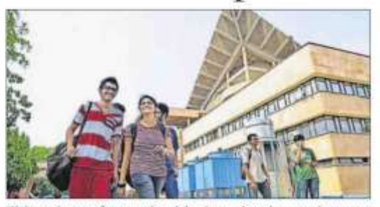
Hiring volumes of conventional tier-I recruiters have not kept pace with the rise in the number of students graduating from IITs.

The public-sector undertakings (PSUs), which usually visited campuses in the second half of the placement period, are recruiting from Indian Institutes of Technology (IITs) and National Institutes of Technology (NITs) in the first few days of the season. Hiring for roles in research and development, digital and engineering teams, they